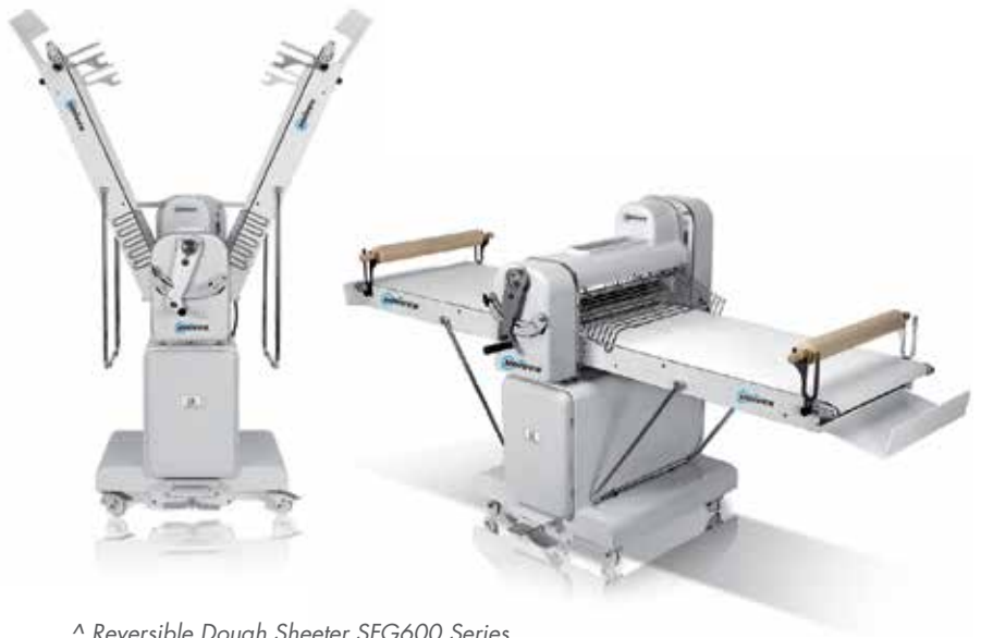
^ Reversible Dough Sheeter SFG600 Series

Sheeter tables feature perfectly synchronized drives. Exit conveyor is faster than entry to avoid possible dough obstruction and prevent tearing of delicate dough. These units also sheet dough onto rolling pins to allow longer than out-feed table length sheets of dough. The versatile SFG600TL features variable speed and cutter rollers in different shapes and sizes (contact factory for details). The SFG500 comes in both bench and floor models. All sheeter tables, (except models TMM and TL) fold upright for easy storage.