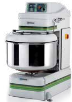
^ Greenline Mixer GL80

Our super-efficient Greenline spiral mixers, GL50, GL80 and GL120, offer energy savings of approximately 25% per cycle. They feature a stainless-steel bowl, spiral dough hook and shaft, control panel with separate low- and high-speed timers, and reverse bowl rotation switch. Greenline mixers are wheel-mounted for easy moving.