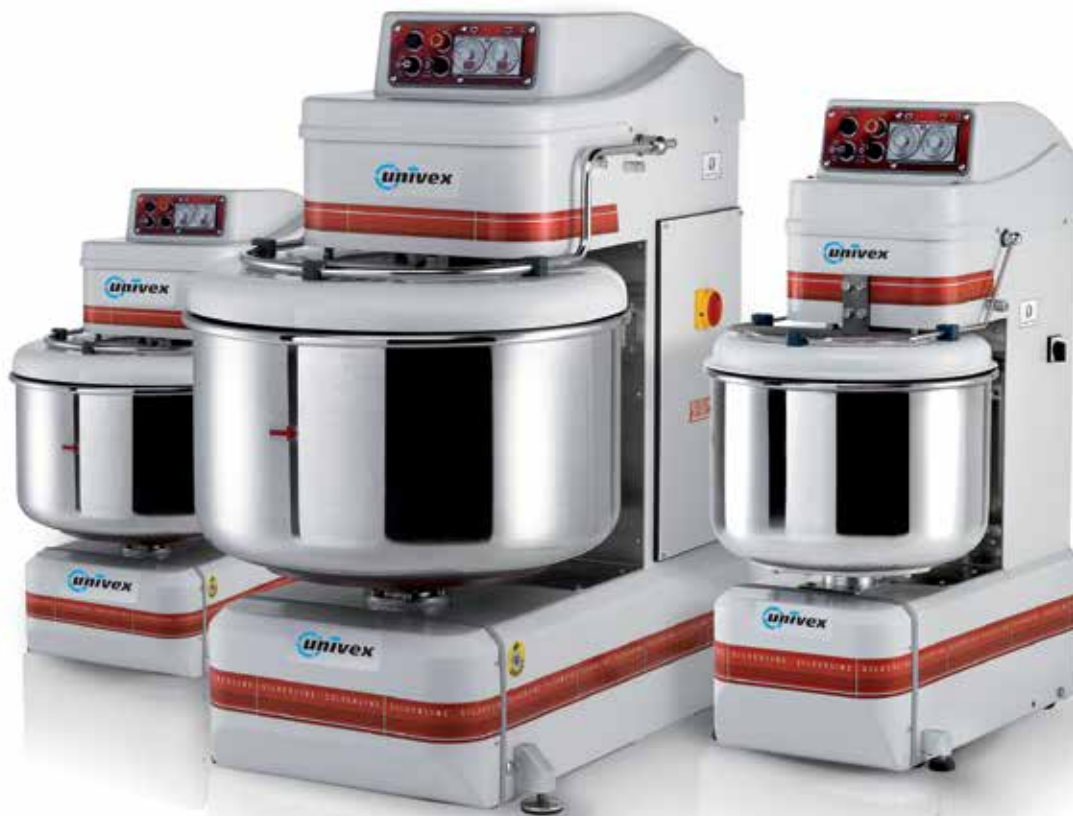
^ Silverline Mixer SL80/SL120/SL50

A key selector enables manual operation if desired. The bowl symbol with selector allows brief inversion of the bowl and spiral to facilitate pre-mixing in 1st speed and enabling easier dough removal.