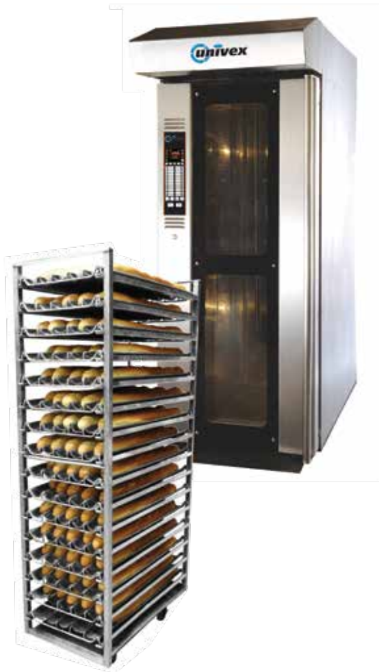
^ Roll In Fixed Rack Bakery Oven

The oven is unique for two great reasons, the small footprint and the ability to access all components and electrical box from the front of the machine. This means one does not have to move the oven to perform maintenance. All gaskets are replaceable without the use of tools and the glass is easy to clean. All these things added up gives you an amazing oven with a small footprint, easy maintenance, and amazing baking quality.