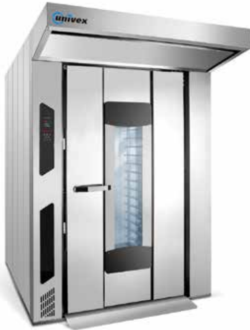
^ Rotating Double Rack Bakery Oven

Univex Rotating Ovens are available in :