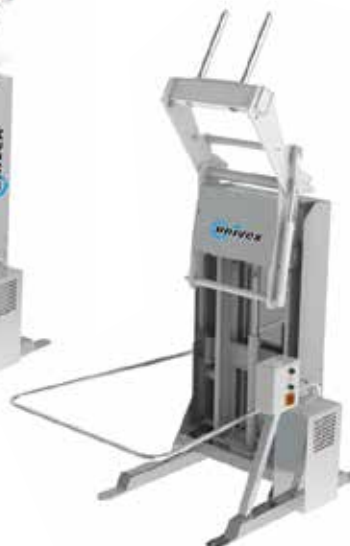
^ Twin Piston Spiral Bowl Lifter