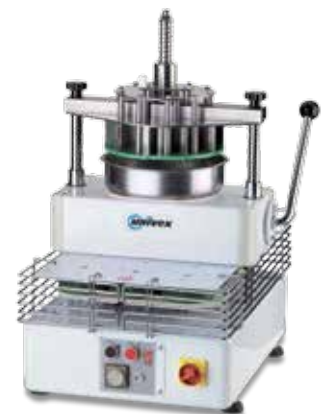
^ DR11/14 Dough Divider-Rounder

This semi-automatic dough divider-rounder model is able to cut and round 600-800 pieces of dough per hour. The portions can weigh from 3 to 11 oz. with the cutting group dividing into 14 sections, and from 11 to 23 oz. with the cutting group dividing into 11 sections. The machine is extremely easy to use, compact and very practical.