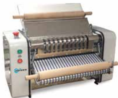
^ T50 Vertical Dough Sheeter