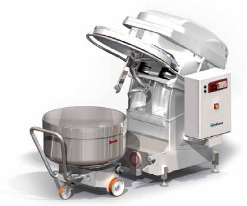
^ Silverline Mixer with Removable Bowl

The OTM line of overturnable mixers is available in models of 120, 160, 200, 280 kg. of dough. Once operator activates dumping control, unit automatically empties dough from bowl onto table, or into a divider. Designed to accommodate specific configurations, these models offer a cost efficient way of reducing the amount of manual labor required for dough processing. Built on a sturdy, reliable structure, OTM models can withstand intensive operation and require very little maintenance.