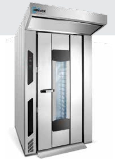
^ Rotating Single Rack Bakery Oven

Heat elements are in direct contact with the baking chamber making space and heat exchange optimized so that less energy is consumed.