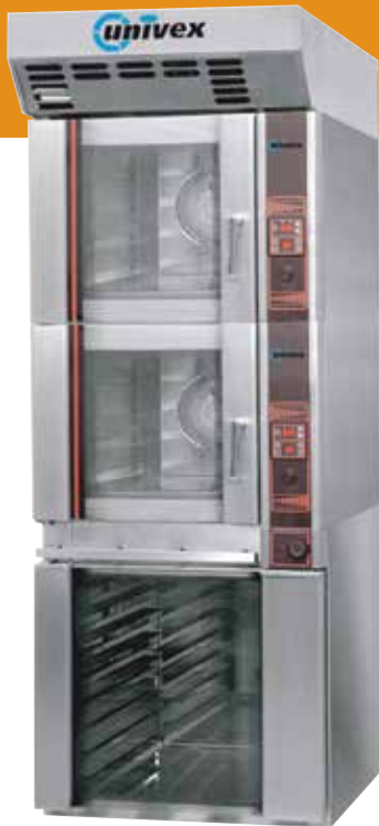
^ 5 Tray Bakery Ovens on a Proofer