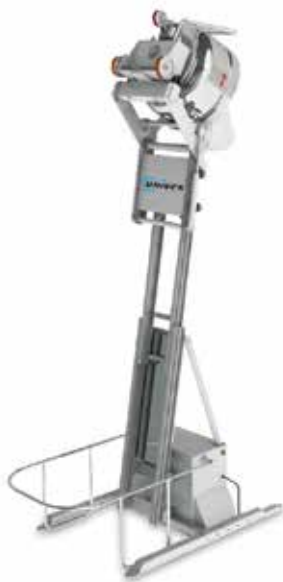
^ Adjustable Spiral Bowl Lifter

Available in two discharge heights: 1.9 mt, 2.6 mt., for use with SL160RB - SL300RB (Special measurements can be built on request.) Maximum lift is 600kg.