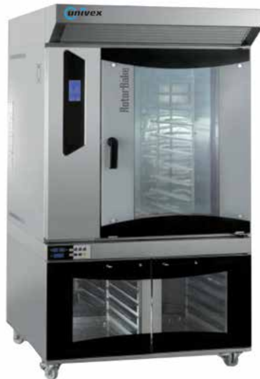
^ Rotating Half Rack Bakery Oven