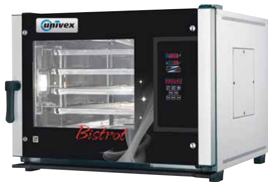
^ Multi-purpose Oven

Touch screen control panel with multiple-user programs simplifies usage while internal lighting facilitates product view. Stainless steel baking chamber features rounded corners for easier cleaning and better airflow. Double glass panel with low heat emission can be easily disconnected for cleaning.