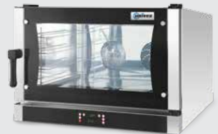
^ Snack Oven

Our multi-purpose convection ovens adapt with ease to a wide range of working environments, from bars to supermarkets, pizza parlors to self-service snack areas. They function well independently, and also in combination with leavening units and other accessories that can augment both their performance and efficiency.