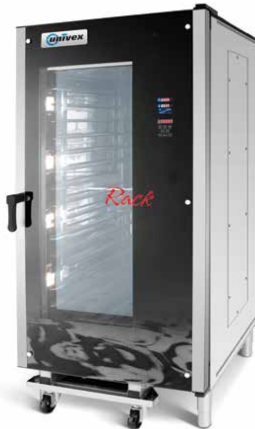
^ Multipurpose rack Oven

Baking with core probe and Delta T - Perfect for controlled, automatic, gradual baking of leavened dough or proteins and vegetables.