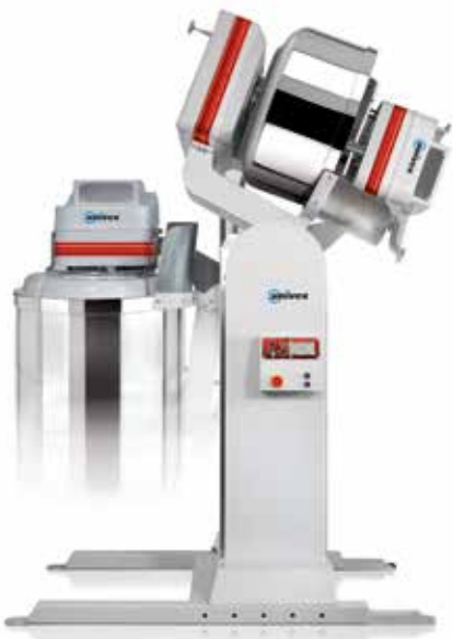
^ Overturnable Mixer

Our Silverline mixers with removable bowls are equipped with an extremely strong electromagnet connection that never wears out.