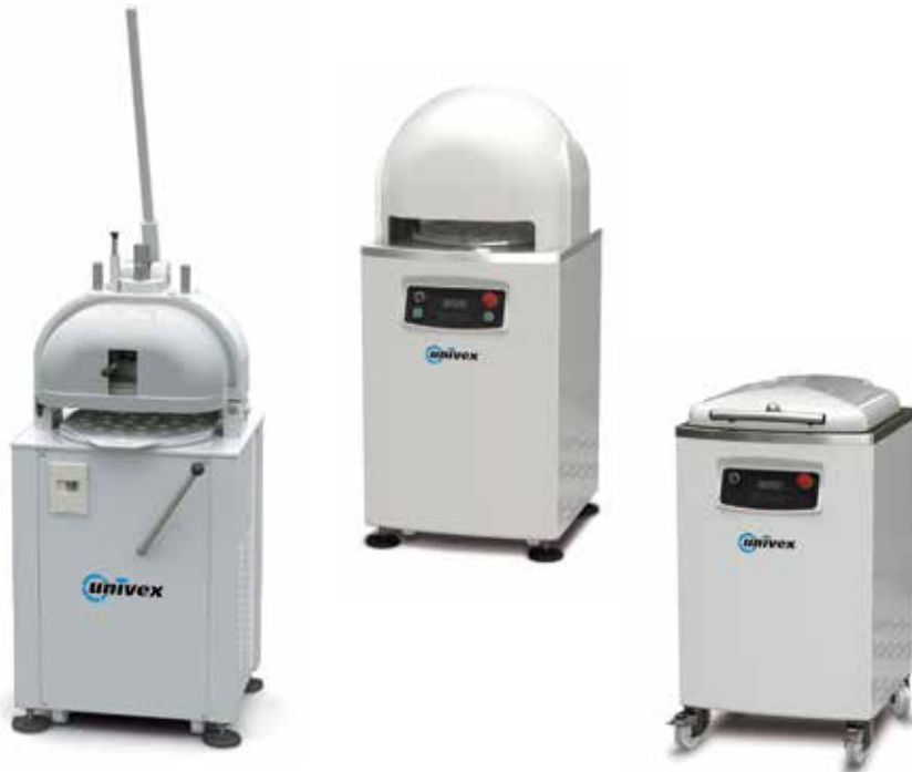
^ Semi-Automatic Bun Divider Rounder/Automatic Bun Divider Rounder/Rectangle, Square or Round Bun Divider Rounder