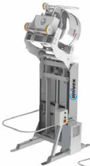
^ Spiral Bowl Lifter